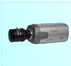
PRO Box Camera Model No.iCam-02