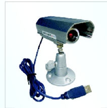
Out-Door Bullet Camera Model No.iCam-04