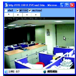
Remote Office Management