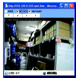
Inventory Loss Prevention