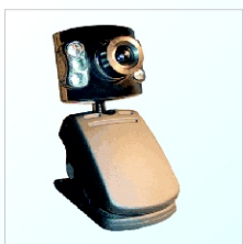
Clip-on IR NV Camera Model No.iCam-01