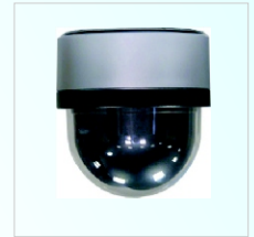
PPO PTZ Dome Camera Model No.iCam-08