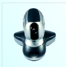
Pan/Tilt/Zoom Camera Model No.iCam-03