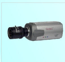
PRO Box Camera Model No.iCam-02