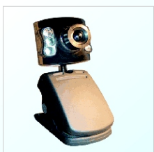
Clip-on IR NV Camera Model No.iCam-01