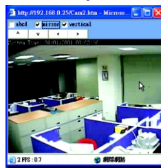
Remote Office Management