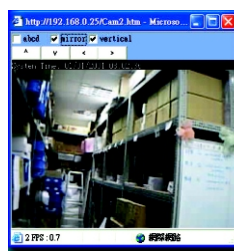
Inventory Loss Prevention